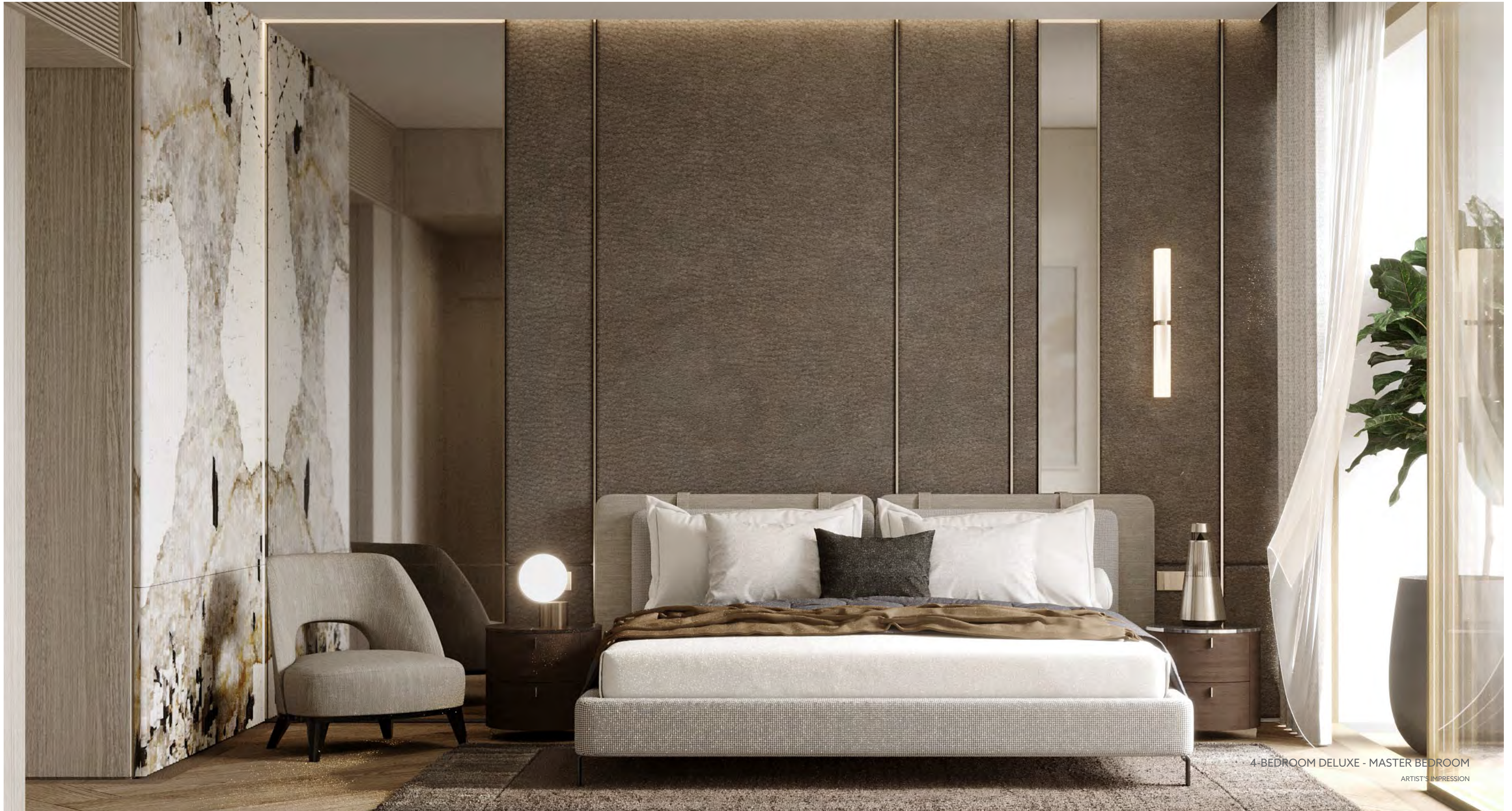
4-BEDROOM DELUXE - MASTER BEDROOM ARTIST'S IMPRESSION

Each bedroom is spacious enough to fit a king-sized bed and comes with an ensuite bathroom for exclusive privacy. Not forgetting its own view of the world outside.