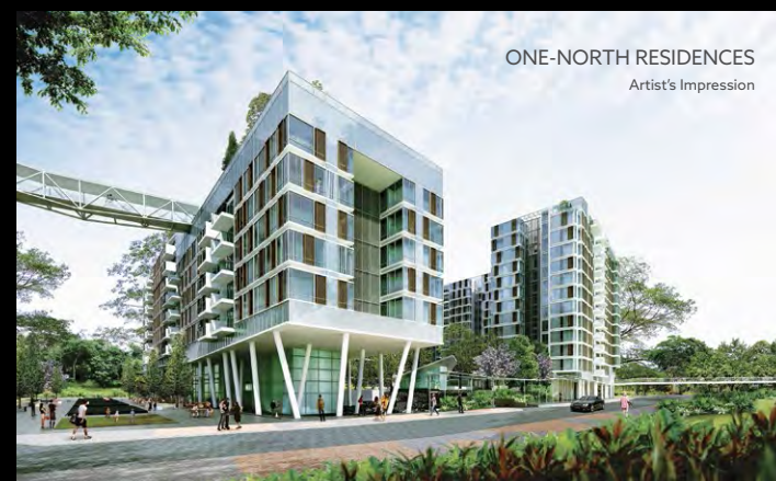
ONE-NORTH RESIDENCES Artist's Impression

Low Keng Huat (Singapore) Limited ("LKHS") is a builder established since 1969. Today its business has grown to encompass property development, investments and hotels. Major development projects include Duchess Residences, One North Residences, Kismis Residences, Parkland Residences, The Minton, Uptown @ Farrer and Paya Lebar Square. Its main investment properties include retail malls at Paya Lebar Square and BT Centre in Singapore. It focuses on constructing in-house development and investment projects. LKHS owns and operates deluxe hotel in Perth (Australia) under the in-house brand Duxton Hotel. In addition LKHS owns serviced apartments in Singapore, Citadines Balestier and Lyf @ Farrer, and both are operated and managed by The Ascott Group. Its other hospitality related business in Singapore is the food and beverage business under our in-house brand name Carnivore.