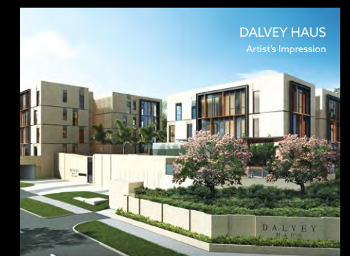
DALVEY HAUS Artist's Impression