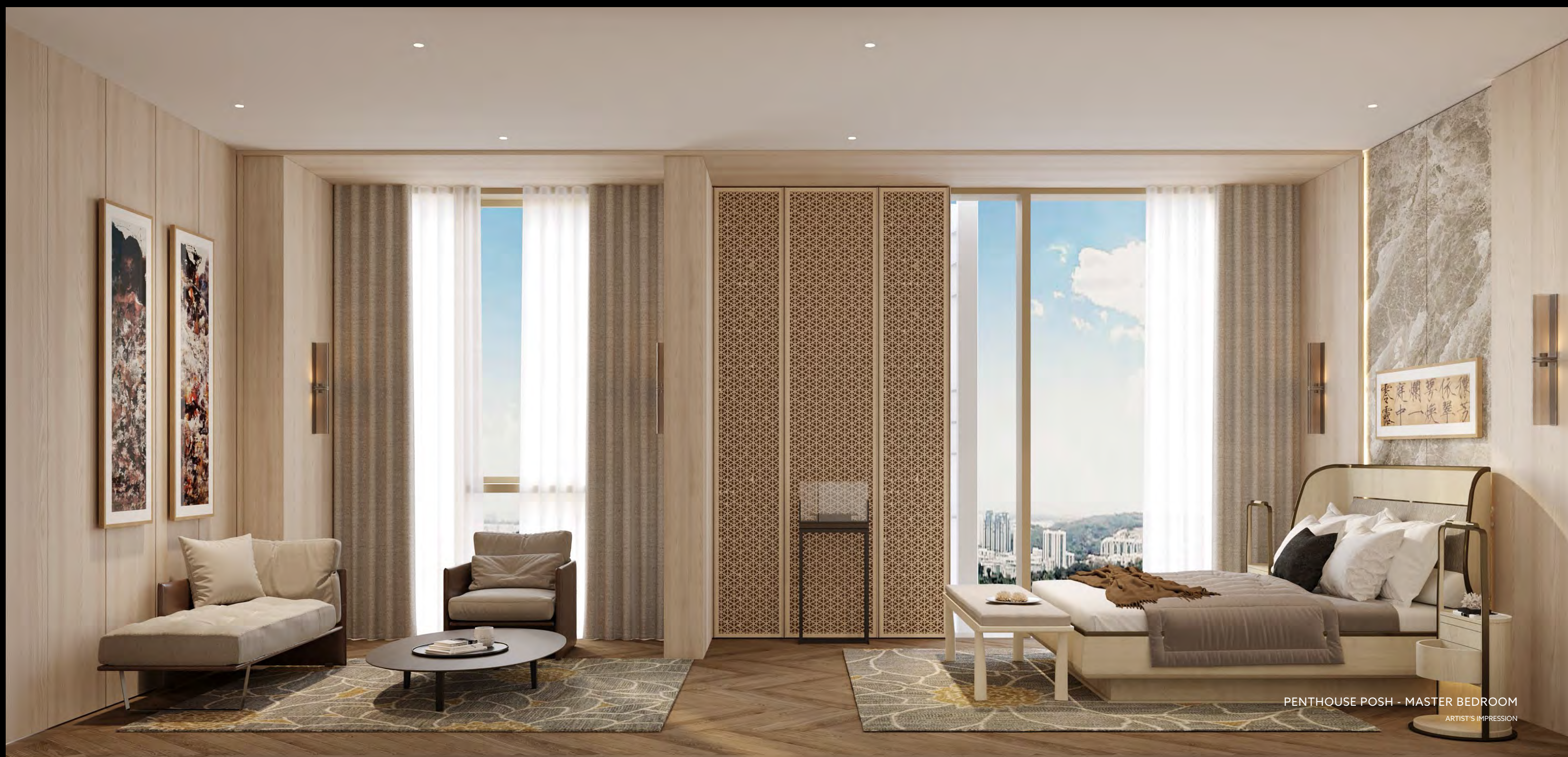
PENTHOUSE POSH - MASTER BEDROOM ARTIST'S IMPRESSION