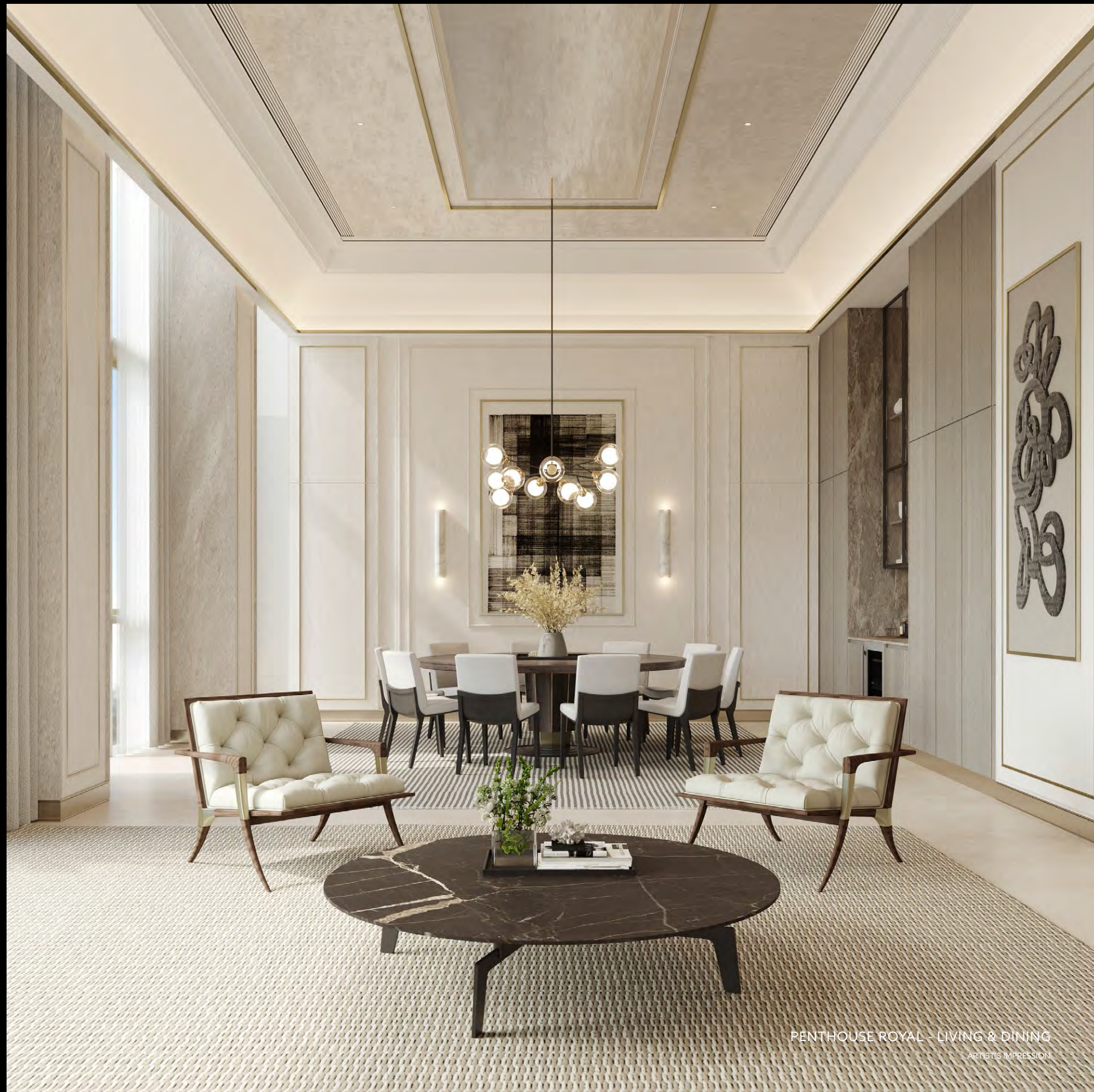
PENTHOUSE ROYAL - LIVING & DINING ARTIST'S IMPRESSION