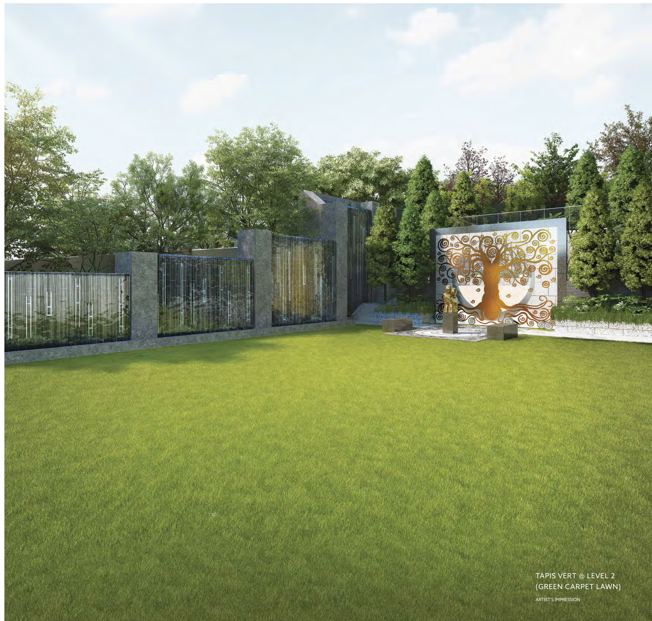
TAPIS VERT @ LEVEL 2 (GREEN CARPET LAWN) ARTIST'S IMPRESSION

Celebrate the luxury and joy of outdoor living at home.