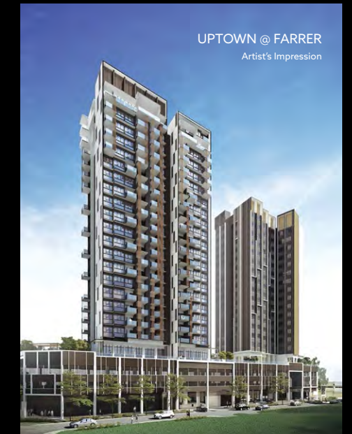
UPTOWN @ FARRER Artist's Impression