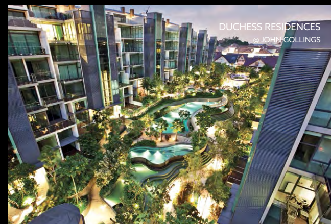
DUCHESS RESIDENCES