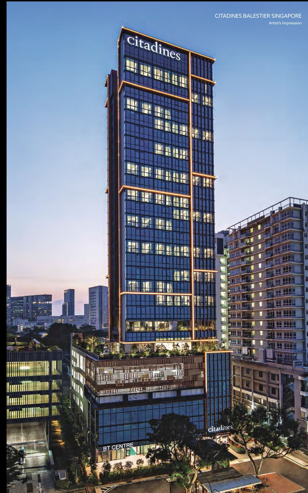
CITADINES BALESTIER SINGAPORE Artist's Impression